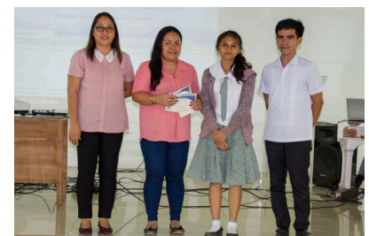
Janel M. Gongora Cabcabon National High School