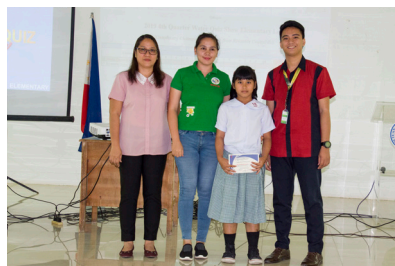
Princess Lesley C. Felias Pareja Elementary School